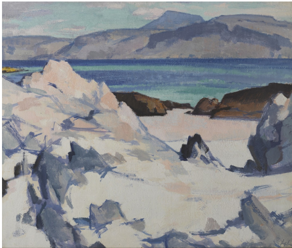
(5) S.J. Peplow , Green Sea, Iona , 1935. (Fleming Collection, Edinburgh)