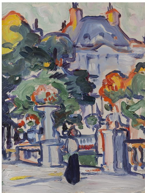
(1) S. J. Peploe, Luxembourg Gardens, c.1910.