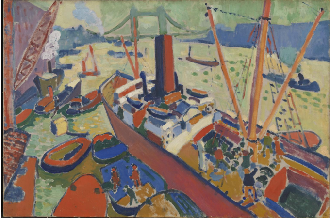
(2) André Derain , The Pool of London , 1906. (Tate, London)