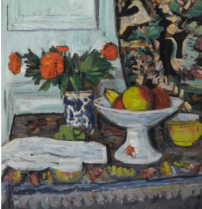
(7) G. L. Hunter, Peonies in a Chinese Vase , c.1928. (Fleming Collection, Edinburgh)