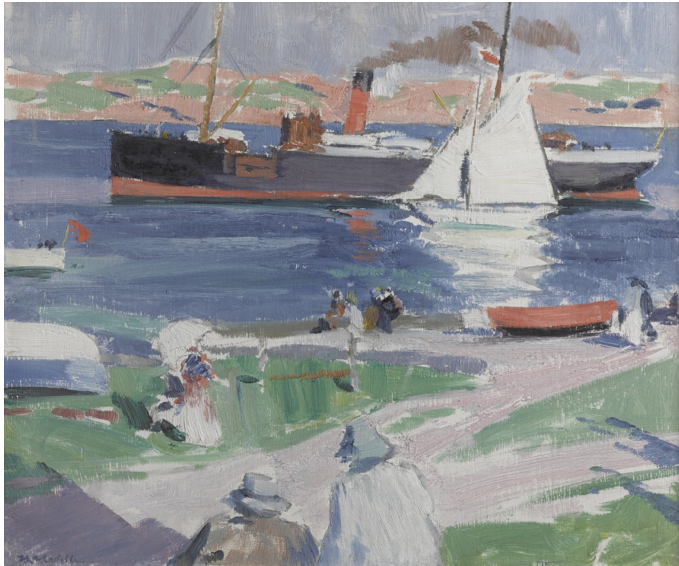
(6) F. C. B. Cadell, The Dunara Castle at Iona , c.1929. (Fleming Collection, Edinburgh)

World War 1 brought down the curtain on the artistic ferment in Paris. At around the same time the two younger Colourists, F. C. B Cadell (6) and Leslie Hunter (7) , were just launching their careers as accomplished artists.