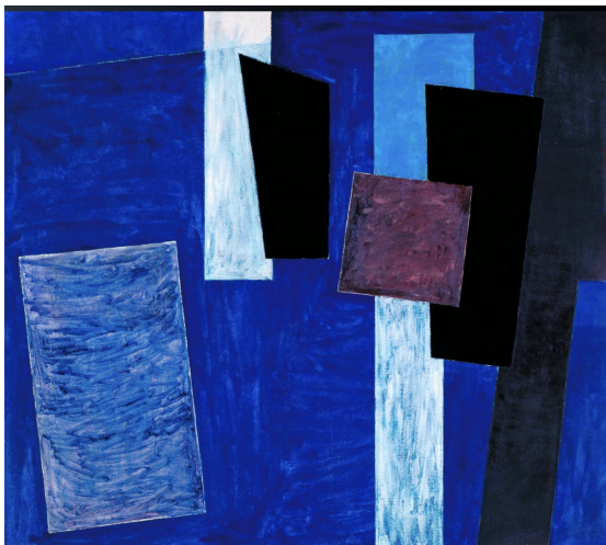
(3) Adrian Heath: Composition, Blue, Black and Brown (1952, Tate)

the Newlyn School in Cornwall and the following year began studying at the Slade School of Art but his studies were broken by the outbreak of World War II. He joined the RAF and was shot down, so he spent almost the entire war as a prisoner of war at Stalag 383 in Bavaria, where he encouraged a fellow prisoner Terry Frost to paint. At the end of the war, he returned to the Slade and on completion of his studies visited St Ives Cornwall (In 1949 and 1951). Here he met Ben Nicholson, forming a link between the St Ives School and the London-based Constructivists Victor Pasmore and Anthony Hill, with whom he was also associated. He was at this time making abstract paintings featuring large, heavily brushed, block-like slabs of colour, as we can see in Composition, Blue, Black and Brown (3). He described the process of evolution of paintings like these as developing by growth, writing, 'The thing of interest is the actual life of the work: its growth from a particular white canvas or board ... It is the process, the method of development that is the life of the painting' .