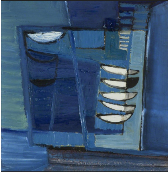
(4) Terry Frost: Walking down the Quays, St Ives (1953, Peter Scott Gallery)

Terry Frost (1915-2003) is known for his bold use of colour and shape inspired by the Cornish environment. He was born in 1915 in Leamington Spa and aged 16 attended evening art classes but didn't take up painting straight away, instead working at many different practical jobs. During World War II he took up painting again, as a prisoner of war in Stalag 383 in Bavaria, encouraged by his fellow prisoner Adrian Heath. Commenting later he described these years as a ' tremendous spiritual experience, a more aware or heightened perception during starvation '. After the war Frost studied at Camberwell School of Art (1947-50) under the Constructivist artist Victor Pasmore, who he described as his god, and his early work was in the gritty, realist tradition of the Euston Road School. In the 50s he lived at St Ives, working as an assistant to Barbara Hepworth, and so he became part of a close circle of emerging British Modernists working with abstraction, including Peter Lanyon and Patrick Heron. His work moved towards abstraction based on his observations of nature, often inspired by the movements of the sea and specifically