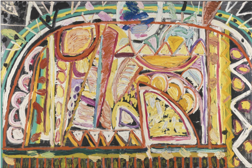
(1) Gillian Ayres: Phaëthon , (1990, Tate)