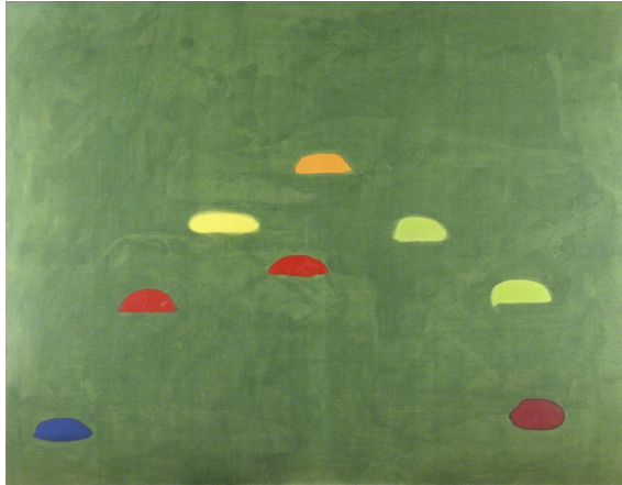
(5) John Hoyland: 14.6.64 (1964, Manchester Art Gallery)

Howard Hodgkin (1932-2017) is an artist who resists easy explanation. Born in London in 1932 to a middle-class family, he spent time in New York, California and took many visits to India forming a large collection of Indian Art. After running away from both Eton and Bryanston School in Dorset he studied at Camberwell School of Art (1949-50) and then Bath Academy of Art, where he could explore abstraction, although it took him until his 40s, when he also came out as gay, to find his consistent style. In Rain (6) , which is nearly 2 m wide, we see the style most associated with Hodgkin - the fluency of the paint, his use of bold colours (he is celebrated as being an outstanding colourist) and the painted frame, perhaps influenced by the decorative borders of Indian art. Although his works appear completely abstract he said he based his works on specific events, usually an encounter between people, 'one moment of time involving particular people in relation to each other and in relation to me' . However his work resists easy categorisation, and he famously did not like explaining his work, so he remains an enigmatic, and important, post-war artist.