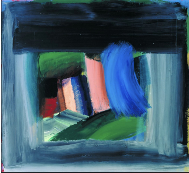
(6) Howard Hodgkin: Rain (1984-9, Tate)