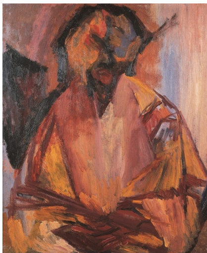
David Bomberg: Last Self-Portrait , 1956, Pallant House Gallery, Chichester

Although Bomberg was to die in 1957 in relative obscurity, his most famous maxim - that an artist should aspire to express "the spirit in the mass" - would remain at the very heart of both Kossoff's and Auerbach's artistic credos. The second part of the session will thus focus on the life stories and careers of these two artists and examine more closely the nature of Bomberg's influence on them.