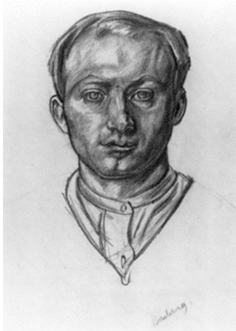
David Bomberg: Self-Portrait , 1913-14, National Portrait Gallery

“WE MUST BUILD OUR NEW ART LIFE OF TODAY UPON THE RUINS OF THE DEAD ART LIFE OF YESTERDAY” David Bomberg