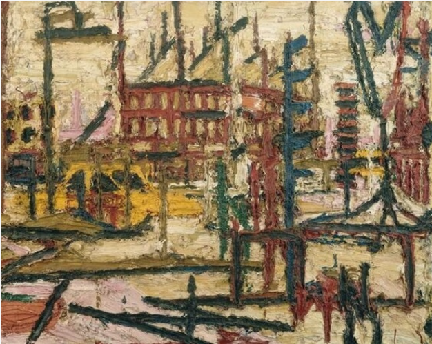
Frank Auerbach: Mornington Crescent , 1965, Tate Britain

Auerbach occupied the same studio in Mornington Crescent (formerly occupied by Kossoff) in Camden for almost seventy years and the surrounding area was a frequent subject in his painting, executed in a characteristic vigorous impasto, for which he made often hundreds of preliminary drawings. As with Kossoff, his portraits were almost always of family and friends. There were major retrospectives of Auerbach's work at the Hayward Gallery (1978) and Tate Britain (2015) and an ever-increasing number of solo exhibitions including one at the 1986 Venice Biennale. He died in London on 11 November 2024.