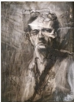
Frank Auerbach: Self-Portrait , 1958, Private Collection

Born Frank Helmut Auerbach into a German-Jewish family living in Berlin, Auerbach was sent to the safety of England in 1939; his parents would perish in the Holocaust. He attended Bunce Court in Kent, a progressive school relocated from Germany after 1933 and studied first at St.Martin's School of Art (1948-52) and then at the Royal College of Art (1952-55), simultaneously attending Bomberg's evening classes at the Borough Polytechnic.