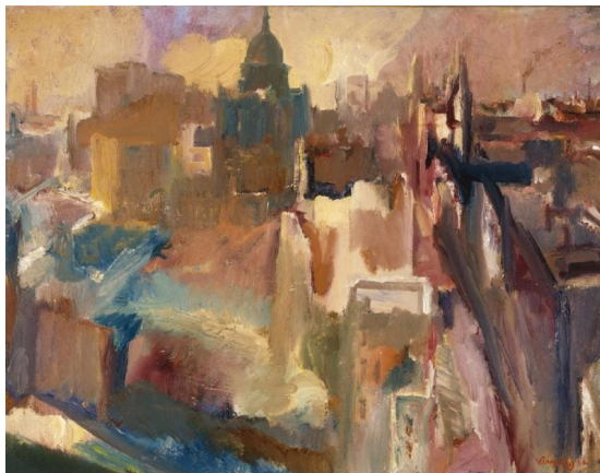
David Bomberg: Evening in the City of London , 1944, Museum of London

During the Second World War Bomberg became an official war artist and began teaching part-time, most notably at the Borough Polytechnic between 1945-53). With his pupils there he formed the Borough Group (1947-9) and the Borough Bottega (1953). In 1954 he moved to Spain, where he remained until he fell ill and was brought back to London, where he died in poverty soon after.