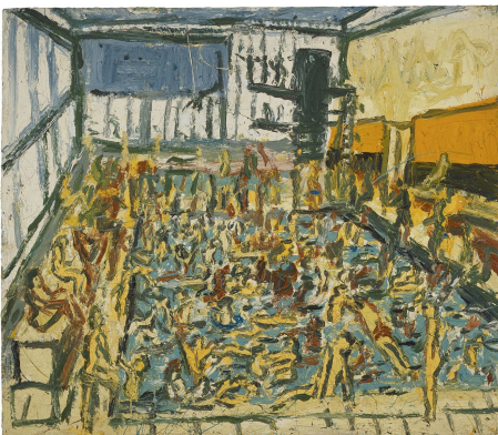
Leon Kossoff: Children's Swimming Pool, Autumn 1972 , Annely Juda Fine Art