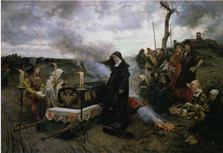
(5) Francisco Pradilla y Ortiz, Joanna the Mad . 1877 (Museo del Prado. Madrid)

and ‘improving’ the Spanish people. History painting – bolstering the current status quo by celebrating Spain’s past - was heavily promoted through official exhibitions like the National Exhibition of Fine Arts (Exposición Nacional de Bellas Artes), established in 1856, and artists competed for state recognition and the chance of prestigious commissions. A key legacy of this system is the 19th century collection in today’s Prado Museum.