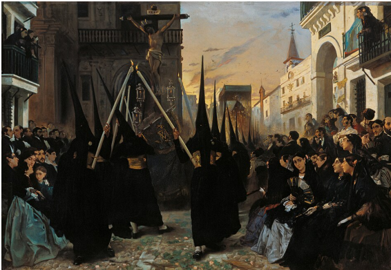
(4) Alfred Dehodencq, A Confraternity in Procession , 1851 (Museo Carmen Thyssen, Málaga)

Within Spain, the state remained the dominant patron of the arts. The 19th century was a period of political instability, marked by civil wars and shifting regimes, but successive governments recognized the importance of art in constructing national identity. The Prado Museum was opened to the public in 1819 – a means of enhancing the country’s international prestige while at the same time educating