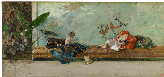
(7) Mariano Fortuny, The Artist's Children in the Japanese Room , 1874 (Museo del Prado, Madrid)

Works such as The Spanish Wedding (6) combined meticulous detail with an almost jewel-like luminosity, appealing to collectors who prized both technical brilliance and exotic subject matter. Yet Fortuny's success was not merely a matter of pandering to taste; his work was also innovative in its treatment of light, texture and colour. His experimental technique is most apparent in late works like The Artist's Children (7) , completed shortly before the artist's death in 1874.