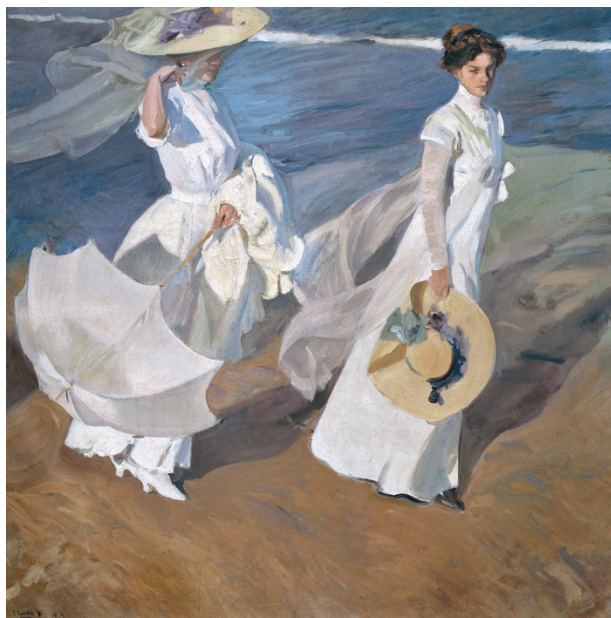
Joaquín Sorolla , Strolling along the Seashore , 1909 (Sorolla Museum, Madrid)