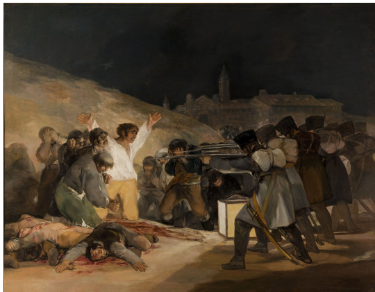
(1) Francisco Goya, The Third of May, 1814 , (Museo del Prado, Madrid)

The story of Spanish art in the 19th century is often framed as an inconsequential passage between key figures: Francisco Goya and Joaquín Sorolla. Yet the reality is richer and more complex, with artists responding to political upheaval at home, shifting perceptions of Spain abroad, and a dynamic interplay between state patronage and the global art market.