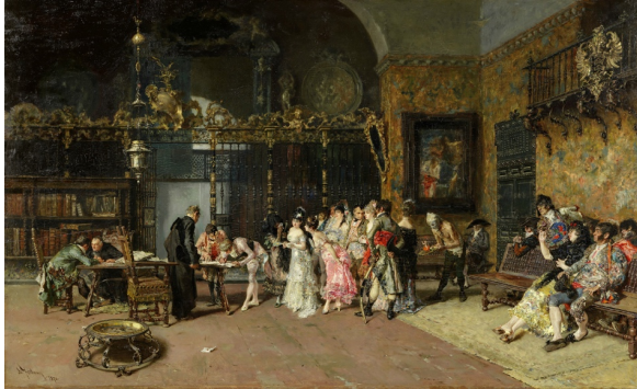
(6) Mariano Fortuny, The Spanish Wedding , 1870 (Museu Nacional d'Art de Catalunya)

attraction for Spanish artists. The most celebrated of these was Mariano Fortuny, whose virtuoso technique and vivid colour made him a sensation in Paris during the 1860s and early 1870s.