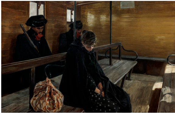
(8) Joaquín Sorolla, Another Marguerite! 1892, (Mildred Lane Kemper Art Museum, Saint Louis, USA)

The international – above all French - influences on Spanish art in this period cannot be overstated. In common with painters across Europe, the Spanish started to address themes from modern life and to innovate in their treatment of natural light and colour. The most important of these was Joaquín Sorolla. Early in his career he drew both admiration and controversy with ‘social realist’ paintings, representing contentious contemporary issues. Typical is a work of 1892, Another Marguerite! (8) , which shows a young woman being taken into custody.