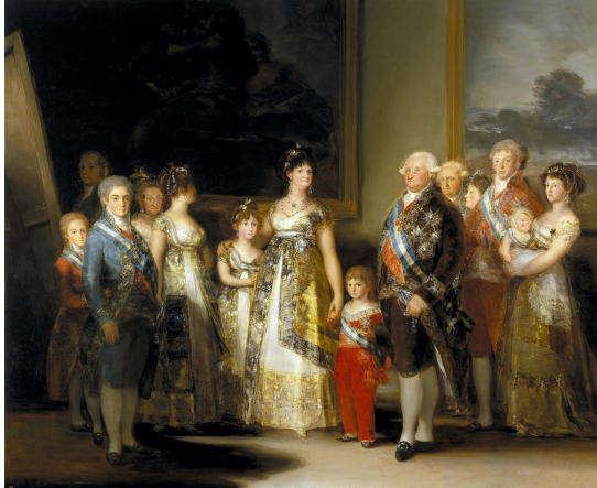
(2) Francisco Goya, Charles IV of Spain and his Family , 1800-01 (Museo del Prado, Madrid)

disillusionment (1) . Some even seem to anticipate the work of 20th century modernists in their psychological intensity and formal freedom. However, Goya was also a court painter, embedded in the structures of royal patronage that would continue to shape the development of Spanish art well into the 19th century (2) .