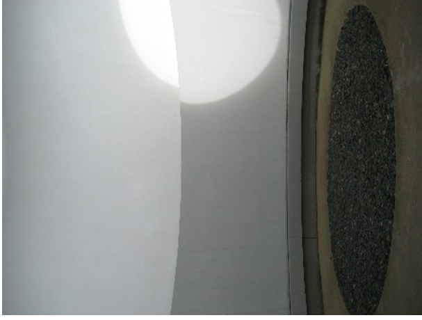
James Turrell's Sky Space in Kielder Water Forest Park