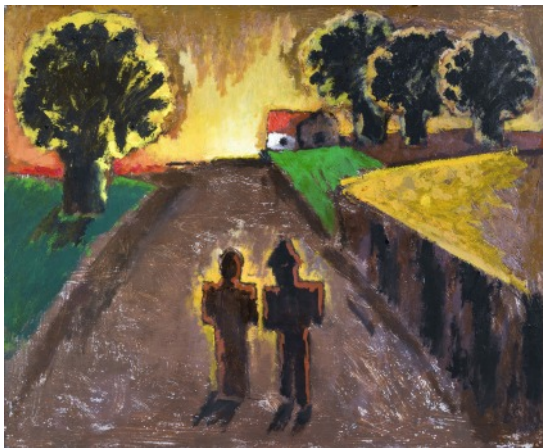
Josef Herman, Untitled , 1985-6