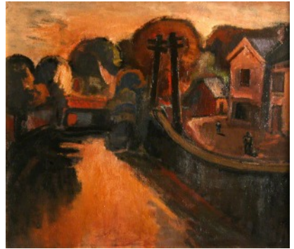
Josef Herman , Pen-y-Bont Inn, Ystradgynlais , c.1949