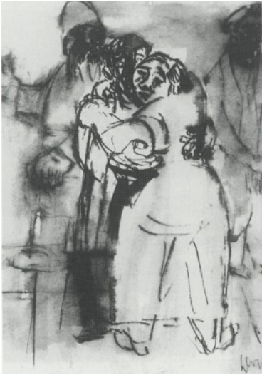
Josef Herman, Leaving Home , 1938(?)