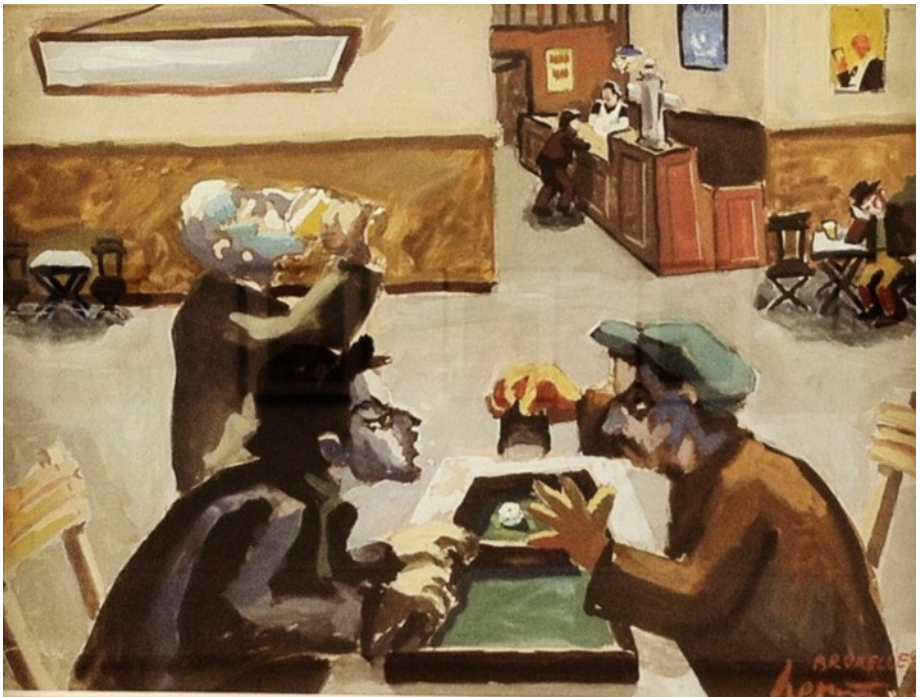
Josef Herman, The Gamblers , 1938

Born in Warsaw in 1911 into a working-class Jewish family, Josef Herman arrived in Britain (via Belgium) in 1940, settling first in Glasgow and then in the South Welsh mining village of Ystradgynlais. By the early 1950s, known mainly for his images of Welsh miners, he had established himself as a major figure in contemporary British art. Throughout his long life (he died in London in 2000) he remained true to his conviction that art and morality should never be far apart, that technique, though important, should always be subservient to subject-matter and that working men and women – whether in Poland, Wales, Suffolk, Mexico or Israel - embody a profound and universal human archetype. Yet, as this seminar will reveal, his oeuvre is far more diverse and complex than even his admirers will have suspected. It precedes the first major exhibition of Herman's work for many years, to be held at Flowers Gallery, London, between 15 November 2019 and 1 February 2020.