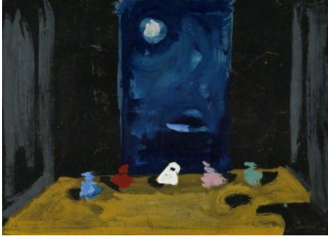
Josef Herman , Set Design for Ballet of the Palette, Celtic Ballet Club, Glasgow, 1942