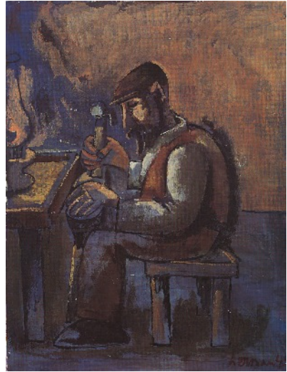
Josef Herman, The Cobbler (or My Father) , 1943