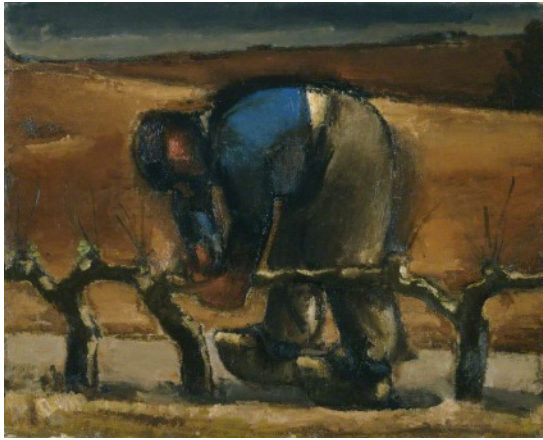
Josef Herman, Pruning the Vines , 1952-3